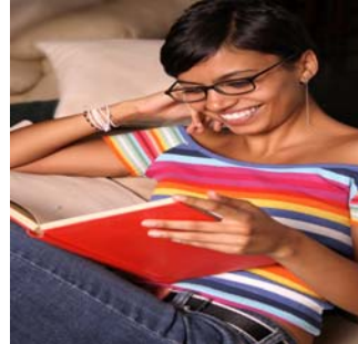
“Make studying, not just homework, but a daily habit” (NEA, 2008)

2) Many of us have struggled with a certain area of study, quite commonly math. Keep encouraging your child to do their best by saying things such as, “I know you can do it!” “Try not to let any of your own negative experiences keep you from supporting and encouraging learning” (NEA, 2008).