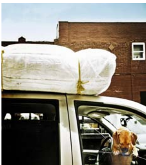
Traveling can be fun!

• Make a check! Prior to traveling, issue everyone a copy of the map of the United States. When a license plate is spotted from a different state, check it off the map. The person who spotted the state license first gets to check it off their map. The person with the most check marks wins.