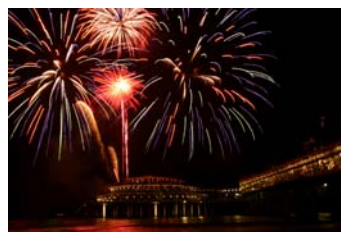
Put added sparkle in 2010's New Year's resolutions.

However, the sincerity and best intentions of students often falls by the wayside as the year progresses. Unfulfilled New Year's resolutions are almost an expectation.